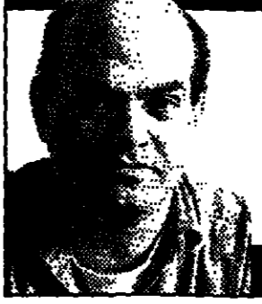
Miss Zaftig By Sam Orbaum

It was over when the fat lady cried. Miss Fat Israel was crowned on Saturday night in Beersheba in a beauty contest of epic proportions. The 20 finalists came in all shapes and sizes: large, larger, zaftig.